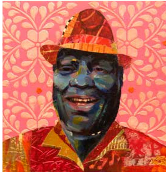
Acrylics, collage, dimensional objects, stencils, ephemera, paint skins