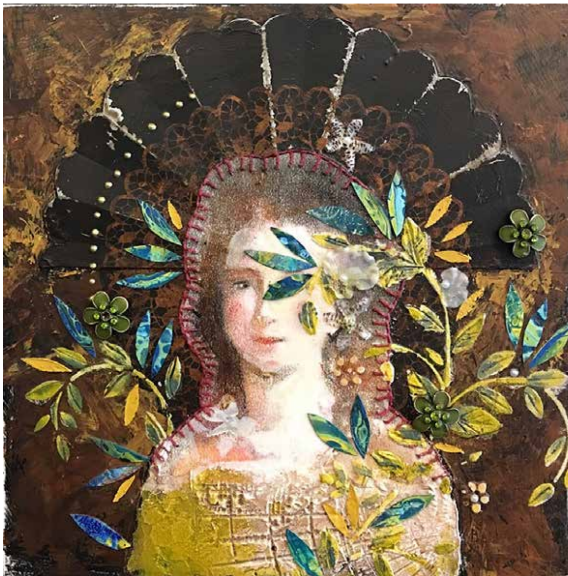
Acrylics, collage, dimensional objects, tin, fabric, thread