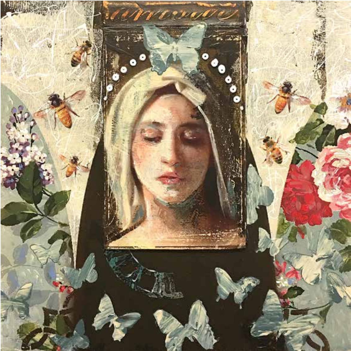
Acrylics, collage, transfer, paint skins