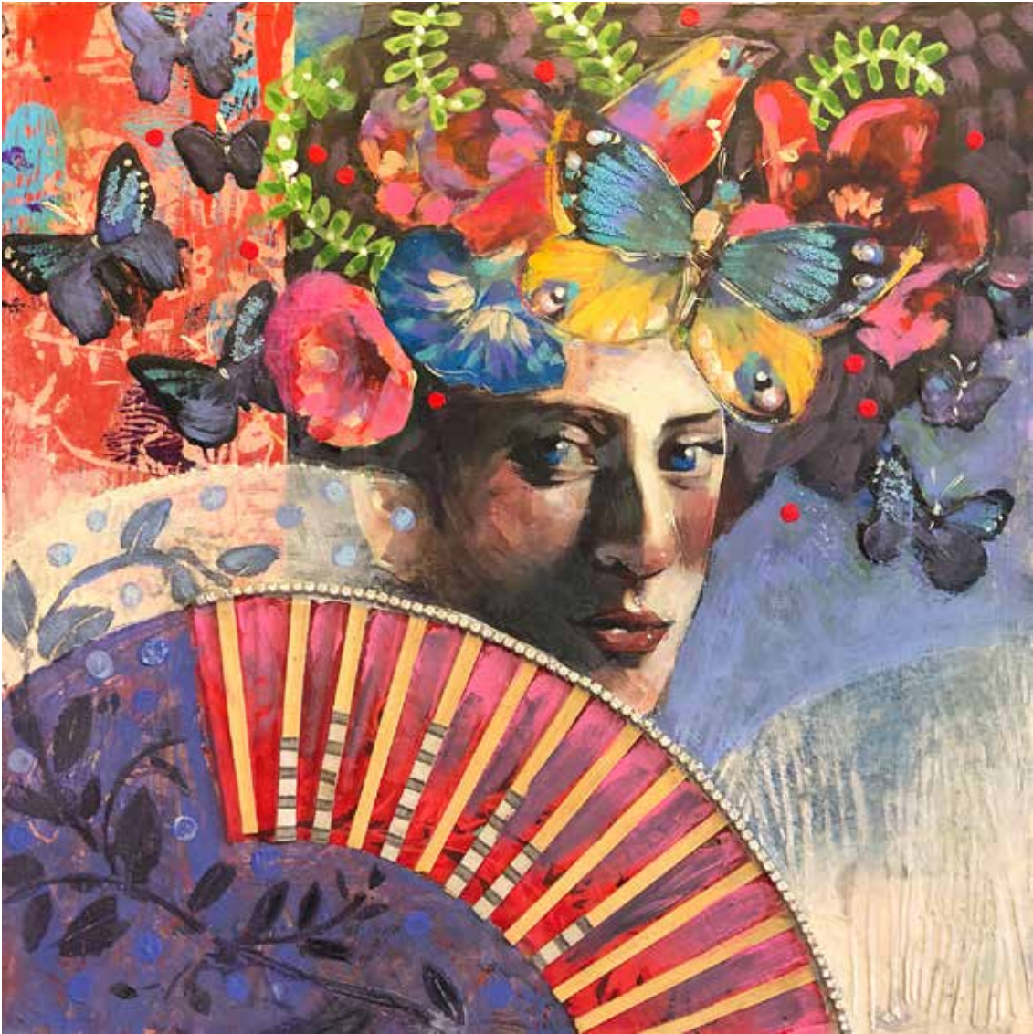
Acrylics, collage, dimensional objects