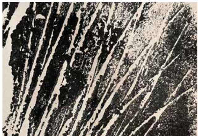
The prints make great collage elements.