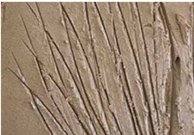
You can cleanly carve the lines or have them rough.

Starting by rolling out a small slab of the clay. Scribe into the clay with different tools or stamp into it. Paint the surface and immediately lay your paper over the clay and use a brayer or rolling pin to get a good print. Peel off. You can get multiple prints with the scribed lines but they will flatten out a little each time.