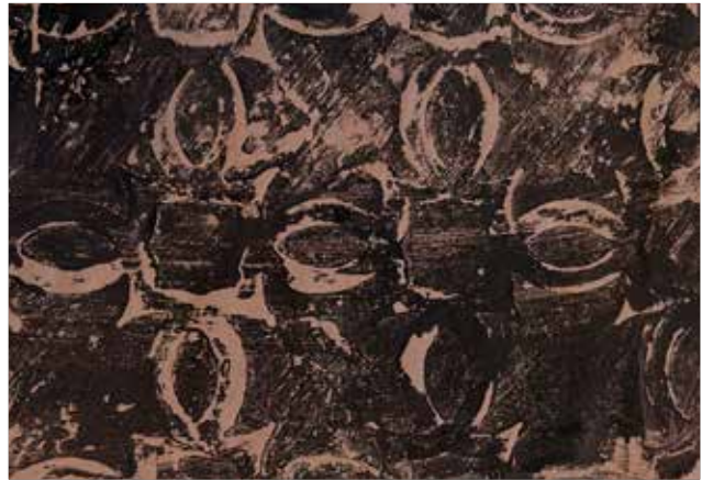
Print over a solid color.