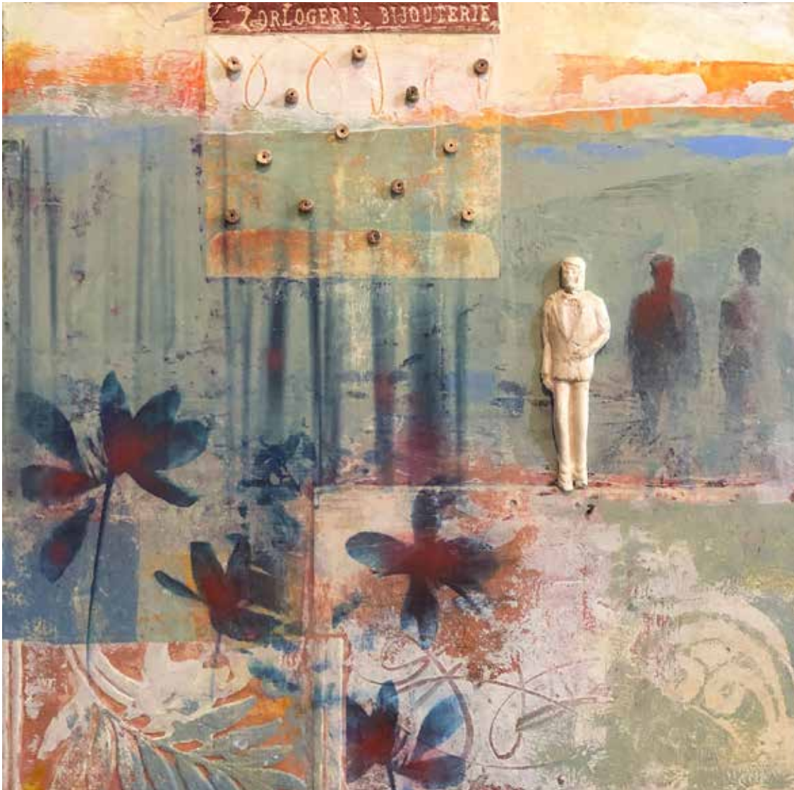
Acrylics, collage, cast objects, stencils, ephemera