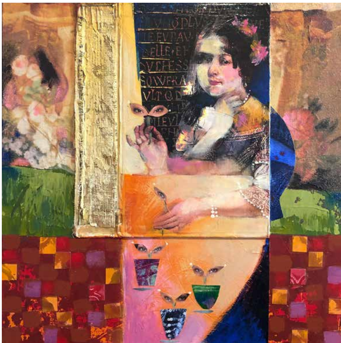
Acrylics, collage, dimensional objects, ephemera, paint skins