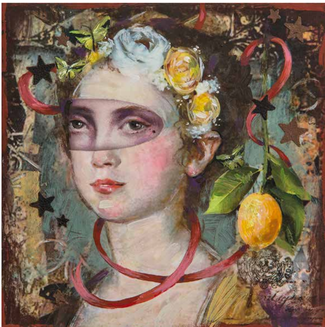
Acrylics, collage, dimensional objects, stencils, ephemera, paint skins