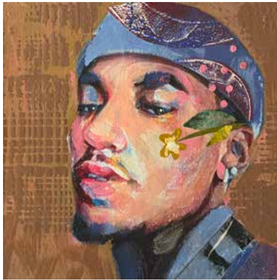
Acrylics, collage, deconstructed stencils, ephemera, paint skins