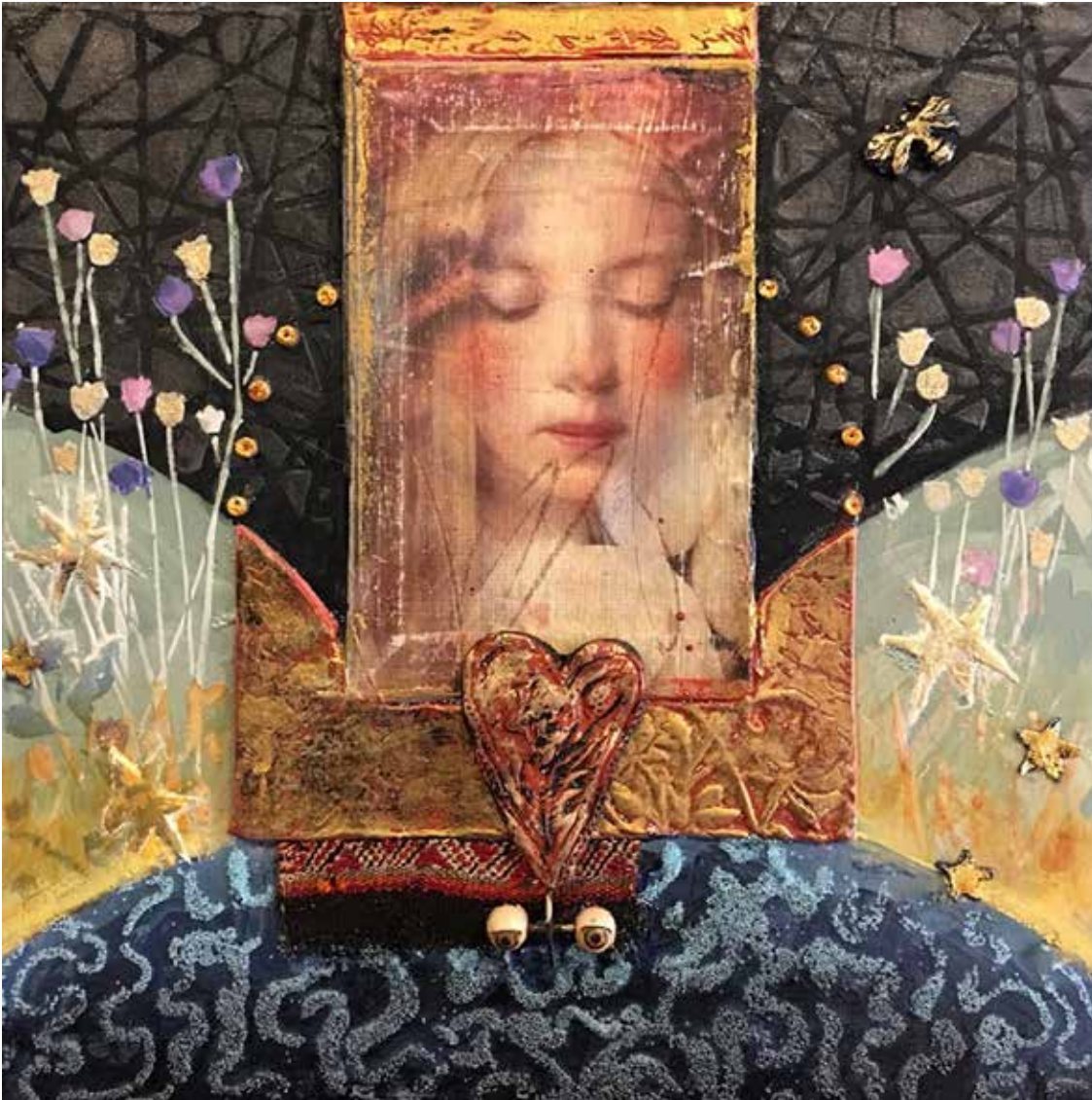
Acrylics, collage, dimensional & cast objects, stencils