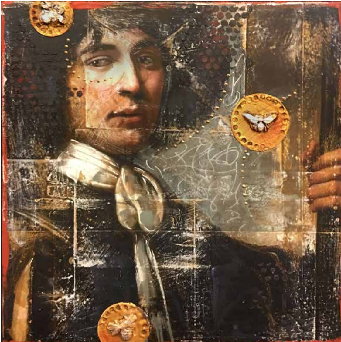
Acrylics, collage, dimensional objects, stencils, ephemera, paint skins