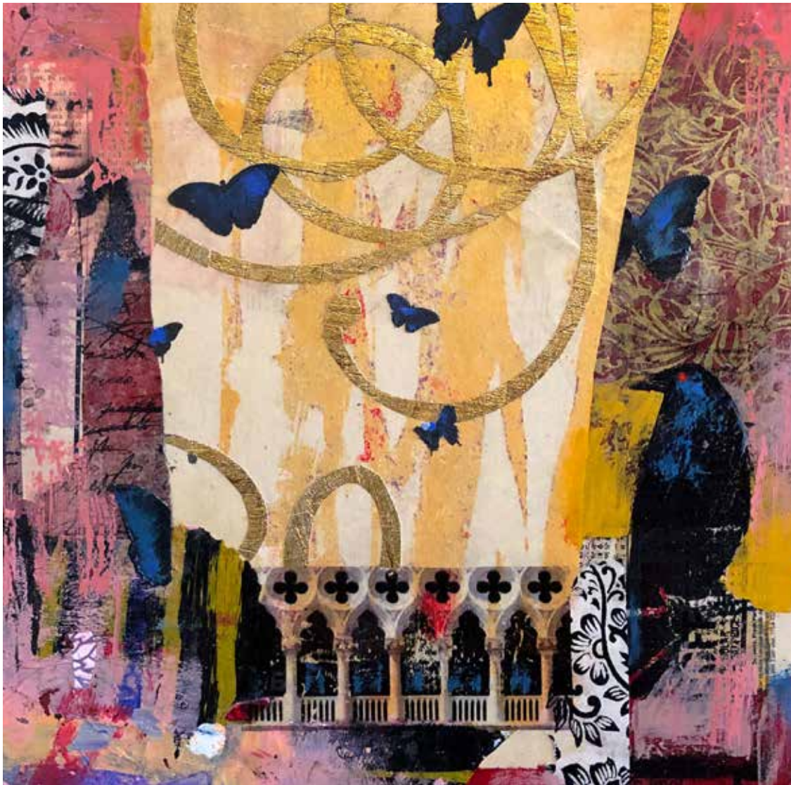
Acrylics, collage, transfer, paint skins