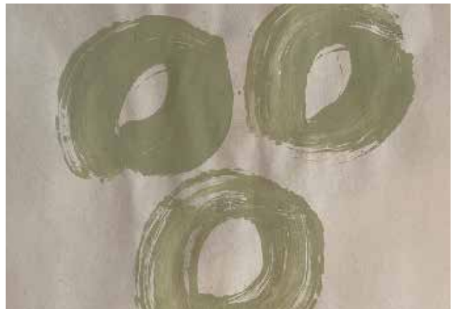
Make print while the paint is still wet.