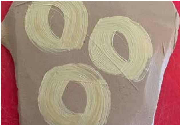
Sample of painting on clay with acrylic paint.

Starting by rolling out a small slab of the clay. Paint the surface and immediately lay your paper over the clay and use a brayer or rolling pin to get a good print. Peel off. Experiment.