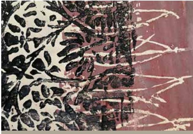
Layering is also more interesting.

Layering techniques always makes a piece of art more interesting. The clay monoprint can be the base of the art or used as a collage element. I will often spend a day making these monoprints so I have drawers full of these wonderful textures to use in my art.