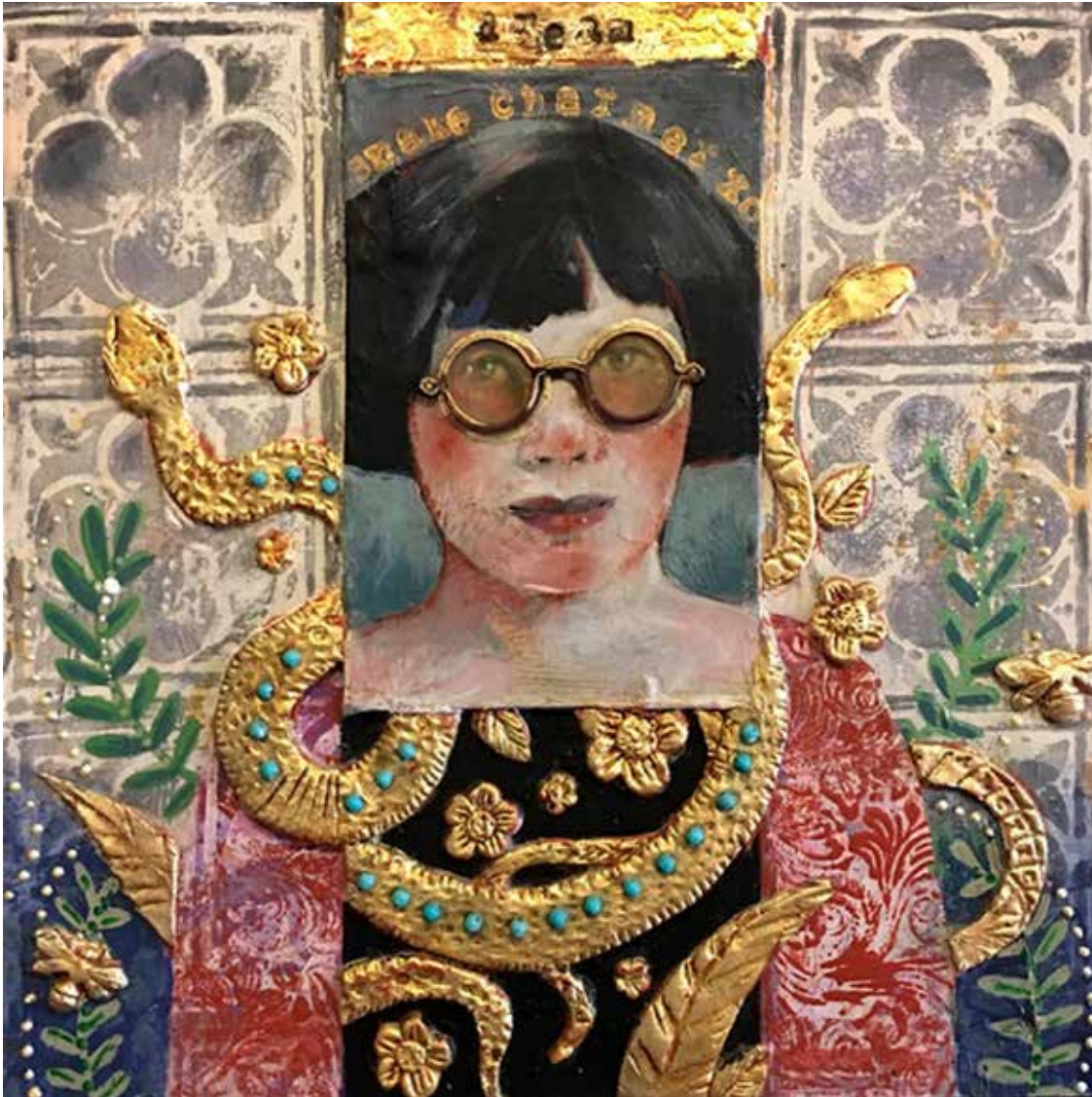
Acrylics, collage, dimensional objects, gold leaf