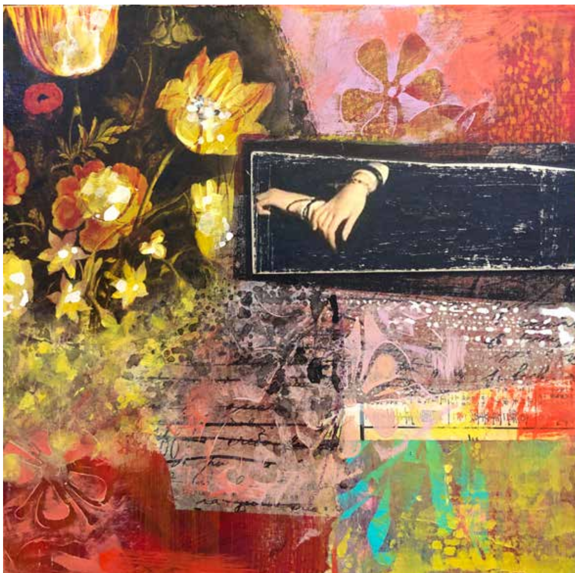
Acrylics, collage, dimensional objects, ephemera