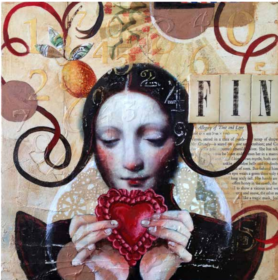
Acrylics, collage, dimensional objects, stencils, ephemera, paint skins